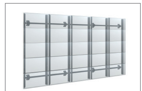
Mount invisible behind the devices